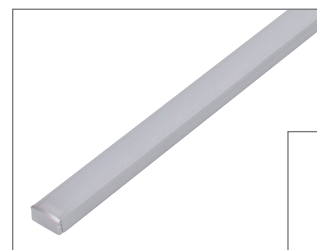
Brushed Aluminium Finish

*** Special powder coat finishes upon request. Surcharges apply.